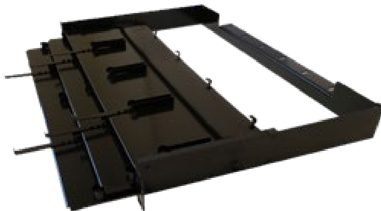
EMPTY 1U TRAY