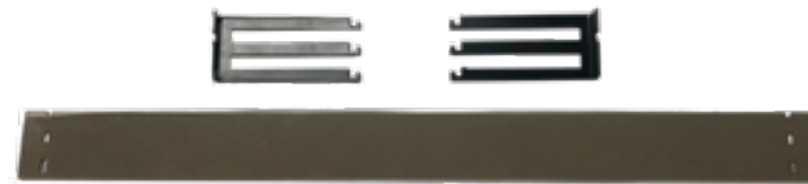
FRONT PLEXI WINDOW